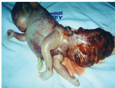
FIGURE 3: Image of a stillborn fetus showing hydrops and a large sacrococcygeal teratoma in which solid components predominated.

3DUS has been used in a manner that is complementary to 2DUS in diagnosing sacrococcygeal teratoma prenatally [10]. Together with power Doppler, 3DUS makes it possible to map out all of the tumor vascularization, since it has the capacity to pick up signals from small-caliber vessels with low flow velocity, which is very common among neoformed vessels. Furthermore, this method enables identification of communication between these vessels and the fetal circulation [7]. In a case described by Sugitani et al. [4], 3DUS with power Doppler was decisive in differentiating sacrococcygeal teratoma from sacral meningocele, by showing a vessel inside the mass.